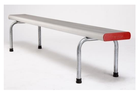
EM021-FS (freestanding version) with powder coated end caps option